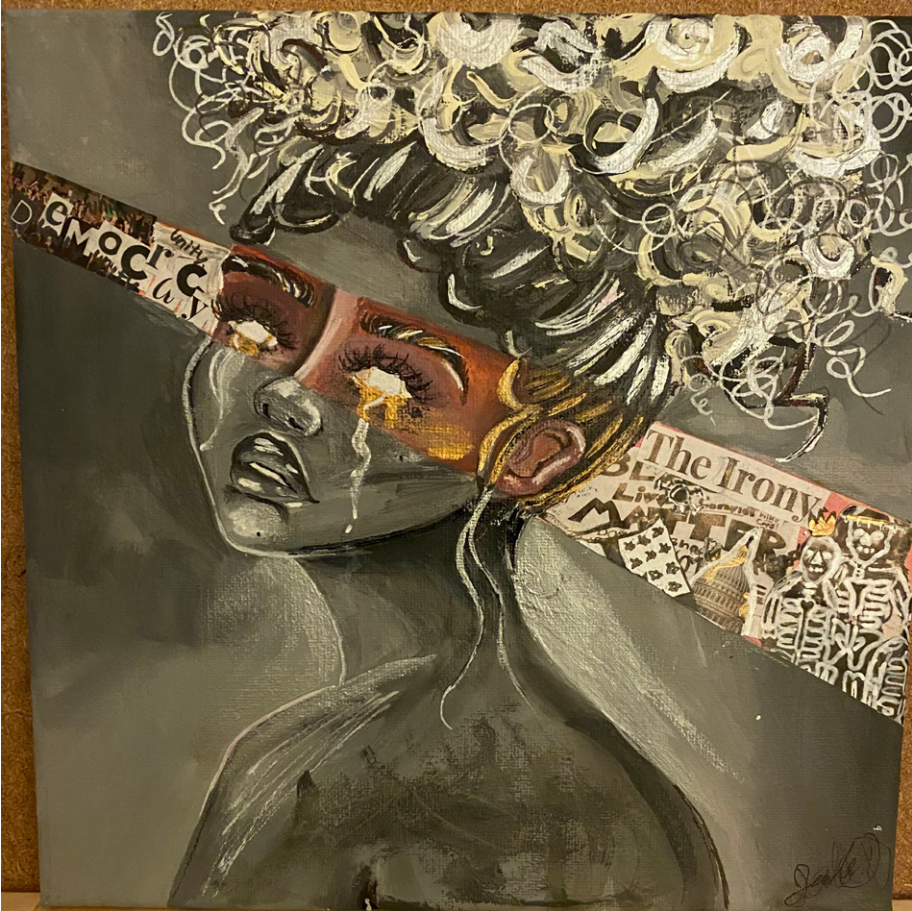
Our Motive, 2021