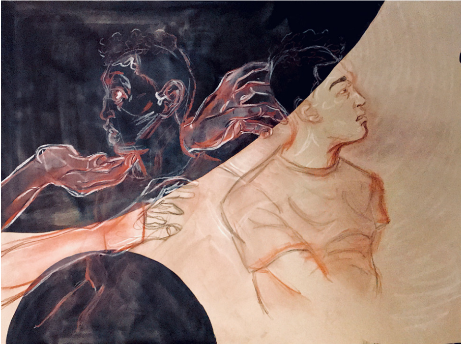
Creeping On, 2021