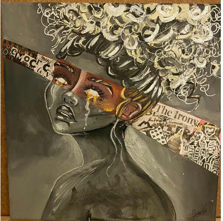
Our Motive, 2021